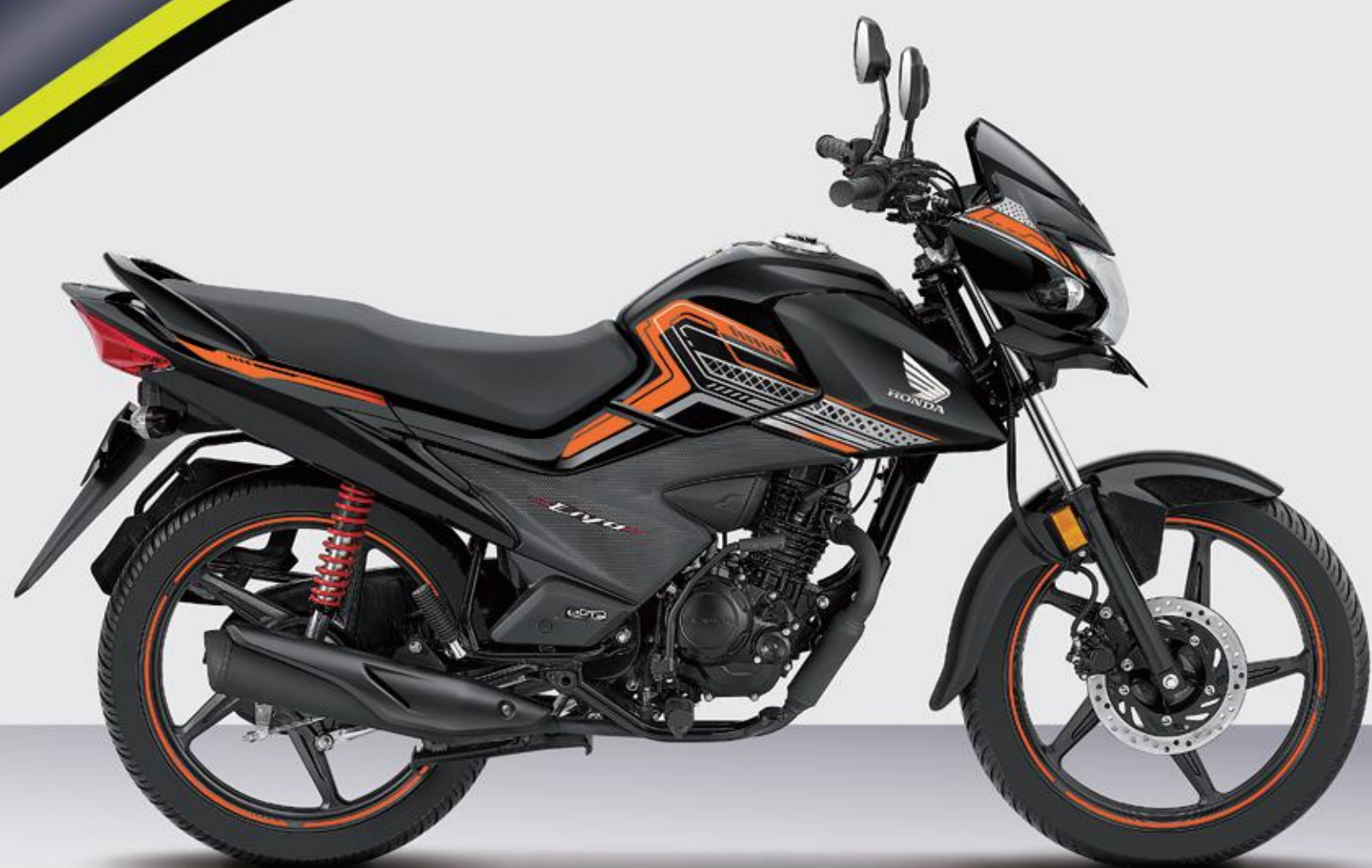
PEARL IGNEOUS BLACK (Pearl Igneous Black Shroud + Orange Stripes)